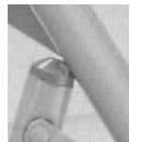
Rear- Leg Caps